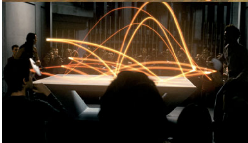
Ping Pong Room