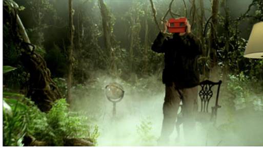
Jungle featuring Josh Gates from Destination Truth