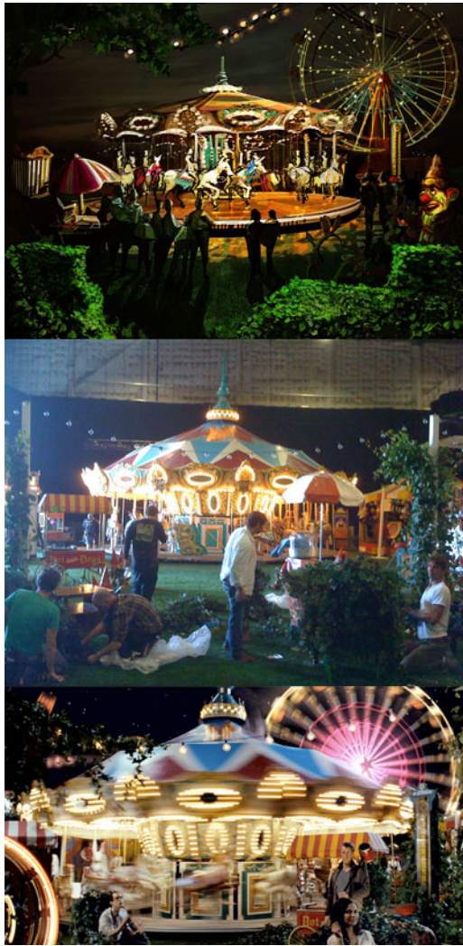
Fairground featuring the cast of Eureka