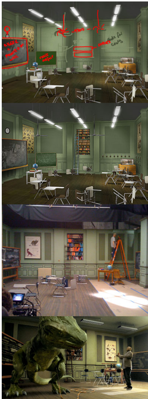
Classroom featuring Scare Tactics host Tracy Morgan