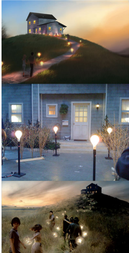
House on the Hill